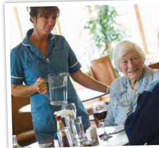
Lunchtime in the restaurant