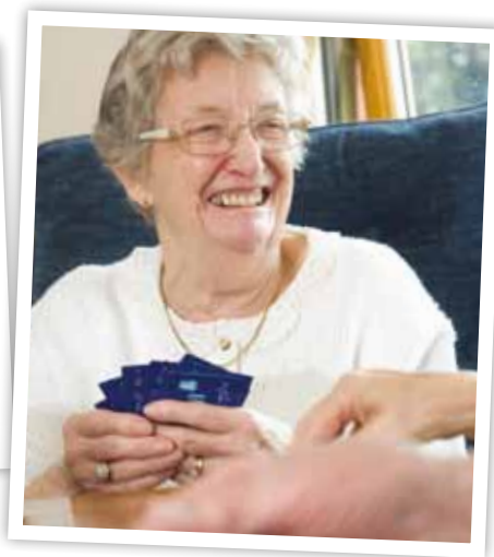
Residents enjoy regular card games