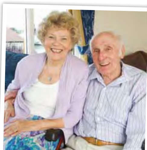
Interior at Barton Mews